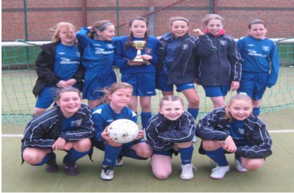
Winners - St. Basil's